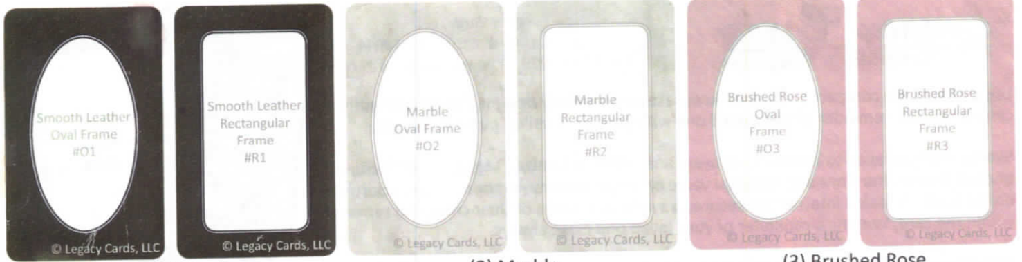
(1) Smooth Leather